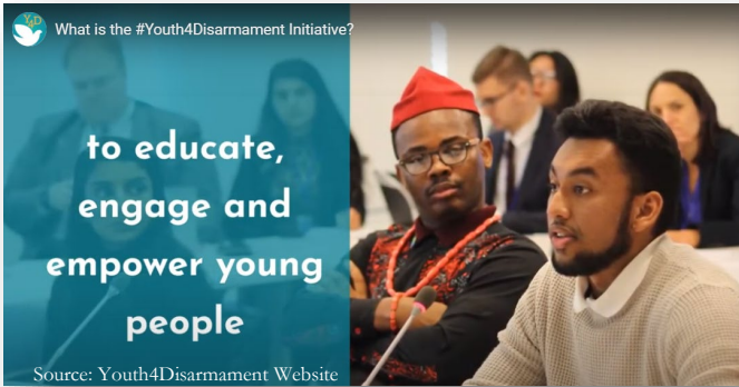
What is the #Youth4Disarmament Initiative?

Toward a World Free of Nuclear Weapons: The Role of Youth as Change Agents in an Age of Global Crisis